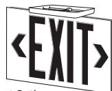
Ceiling Mount Option