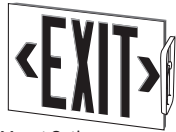
Flag Mount Option