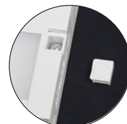
Pre-positioned installation screws