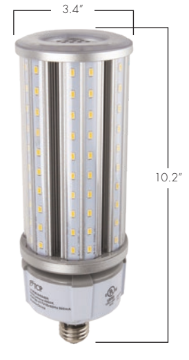
L45MHE2650 Weight: 2 lbs