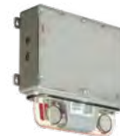
Severe™ VH Battery unit PG. 112-113